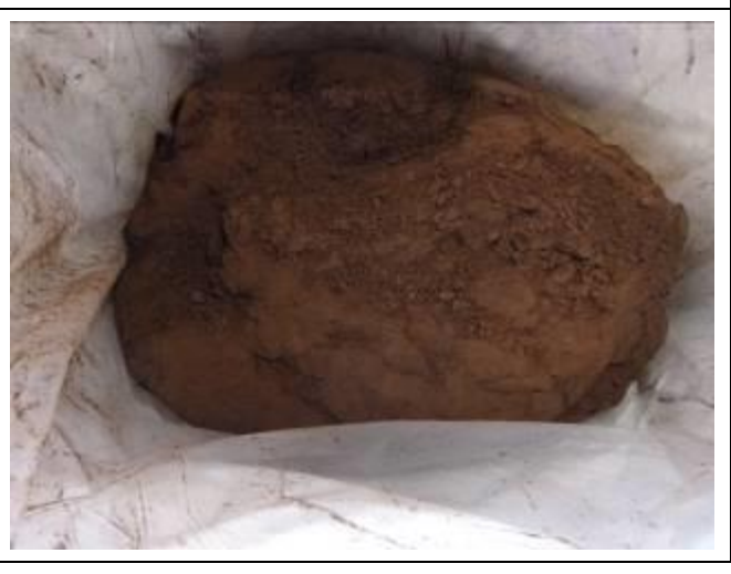
Page 4 of 6