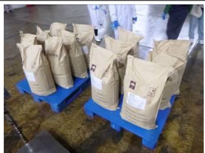
13 bags taken out