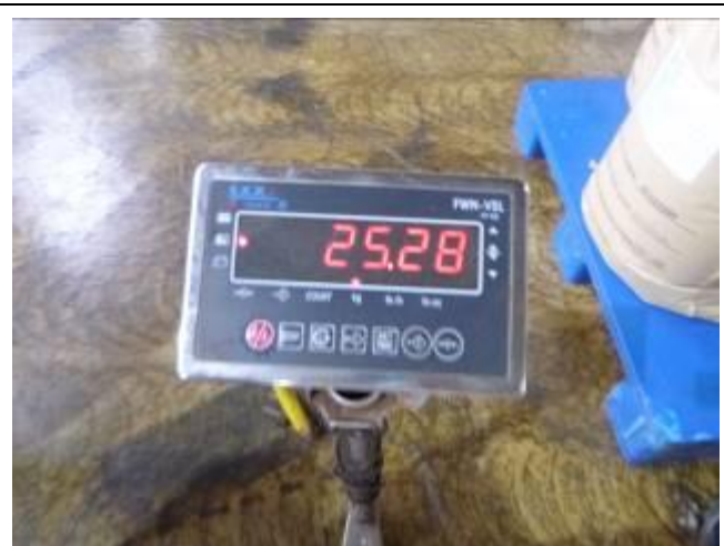
Gross weight checking