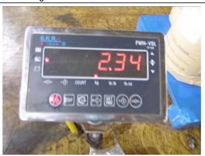
Page 2 of 6