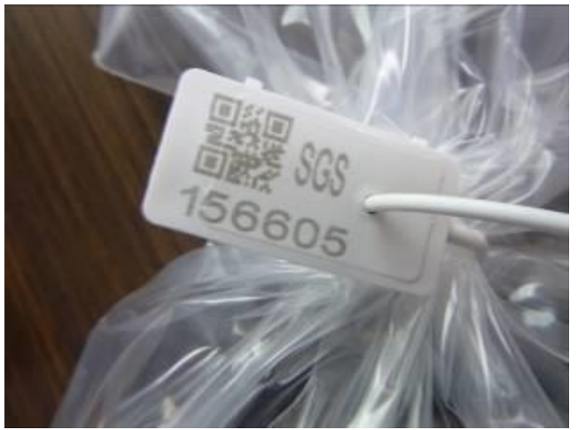
The composite sample