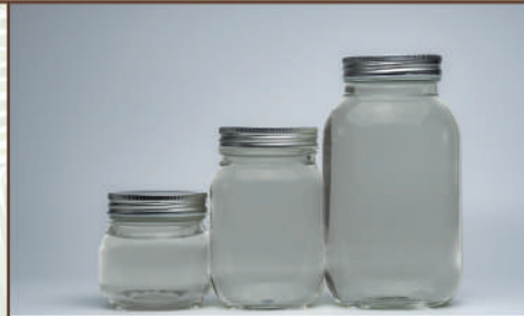
GLASS JARS WITH SCREW CAPS