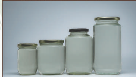
GLASS JARS WITH LUG CAPS