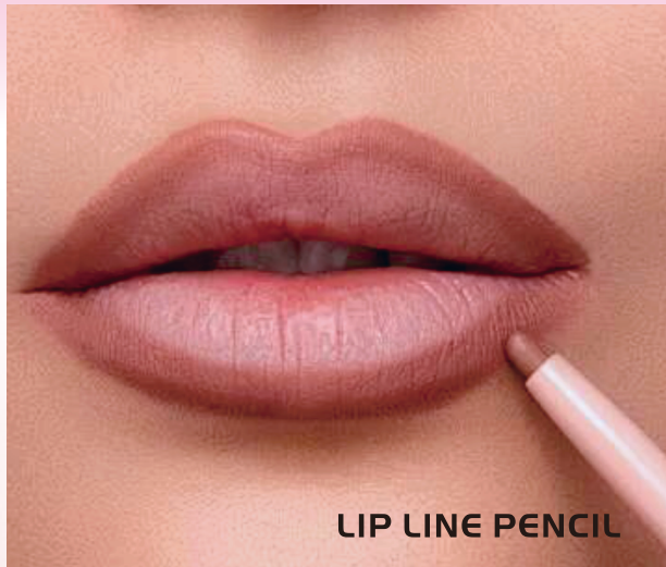
LIP LINE PENCIL

Soft, fine-tipped lip liner, Easy to draw a delicate Thin line.